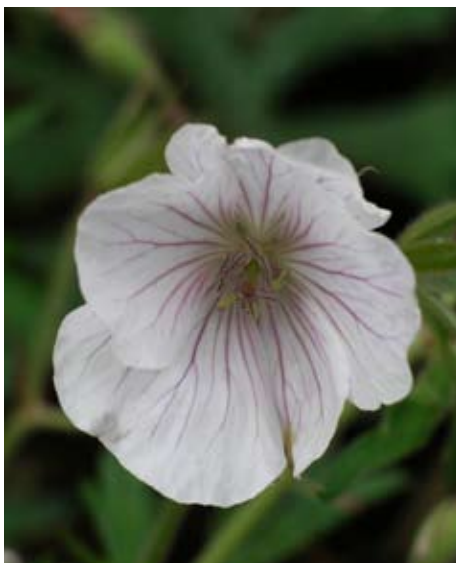
Above: Geranium 'Katherine Adele' Right: Lavender is used extensively around the terrace

the garden around the hotel's entrance. What was a scruffy, narrow border has been transformed into a colourful summer and early autumn display in two L-shaped beds.