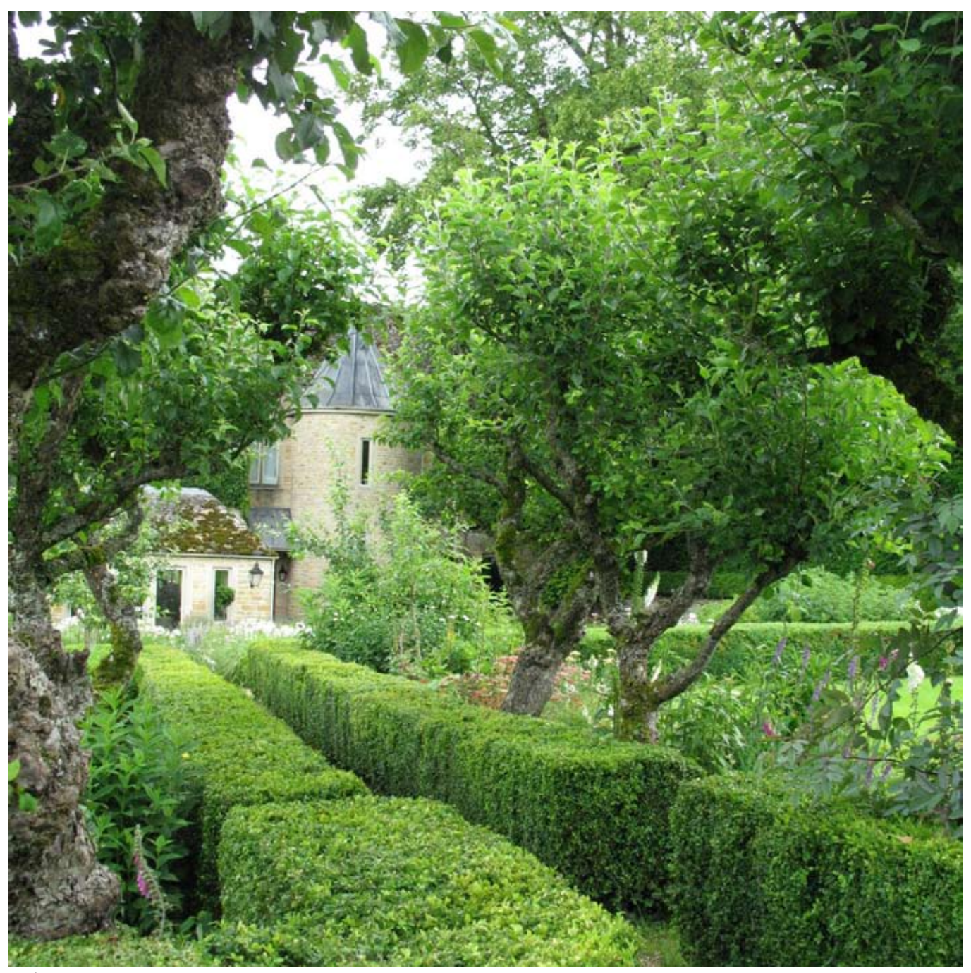
Old fruit trees and box hedging give the Walled Garden year-round structure

"There was Japanese knotweed and every other problem weed you can imagine."